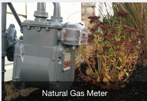
Natural Gas Meter

A natural gas meter allows natural gas to go into houses, apartments and businesses for appliances. The meter lets you and the natural gas company know how much you have used. Natural gas equipment like meters and pipelines are very important and they should be left alone.