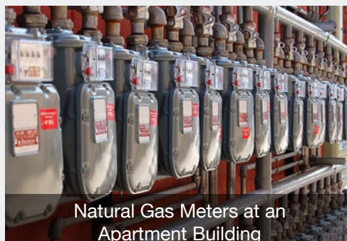
Natural Gas Meters at an Apartment Building