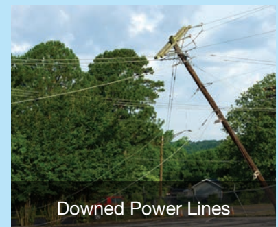
Downed Power Lines