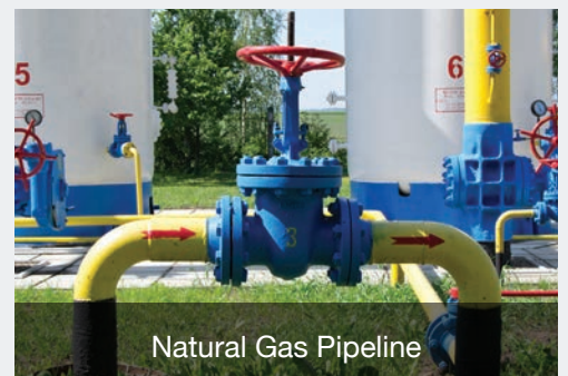
Natural Gas Pipeline