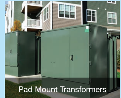
Pad Mount Transformers